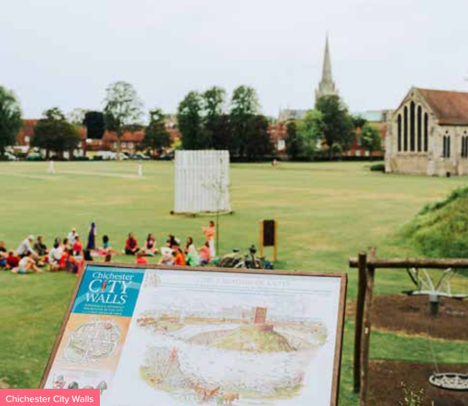
Chichester City Walls