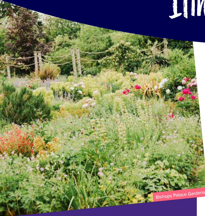
Bishops Palace Gardens