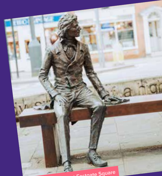
John Keats Statue at Eastgate Square

If you are lucky enough to have tickets booked for a performance at Chichester Festival Theatres , grab a bite to eat at one of the many restaurants offering pre-theatre menus. If time is on your side, why not enjoy a pre-dinner stroll around Chichester to take in some of the statues, monuments and plaques dedicated to Chichester's historical figures of significance.