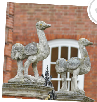
Pallant House Gallery